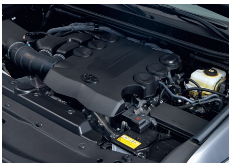
4.0L 1GR-FE GAS ENGINE WITH 275 PS AND 381 NM TORQUE