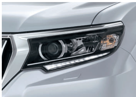
LED PROJECTOR HEADLAMPS WITH DAYTIME RUNNING LIGHT