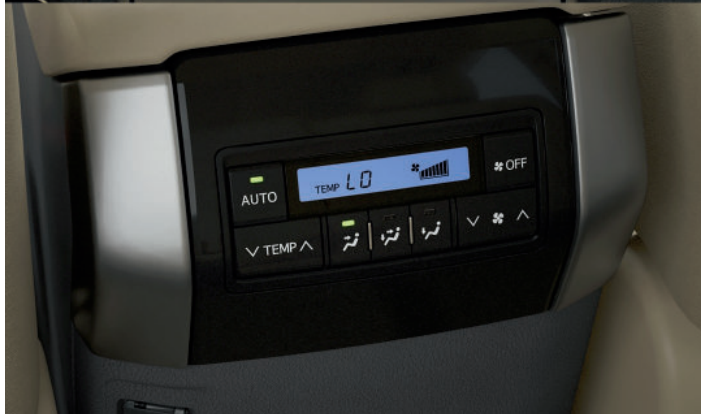
FRONT A/C CONTROL, REAR INDEPENDENT A/C CONTROL