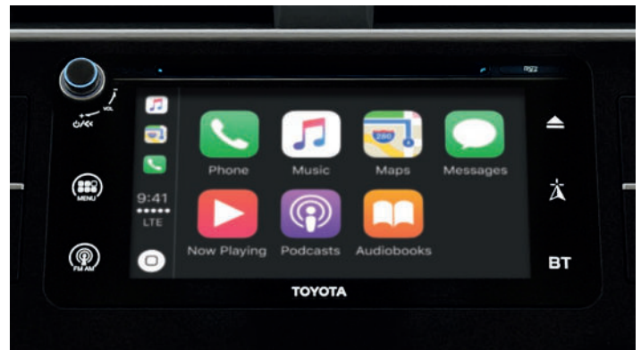
6 SPEAKER DISPLAY AUDIO WITH APPLE CARPLAY AND ANDROID AUTO