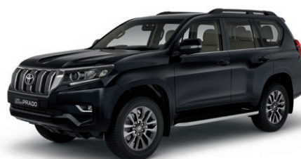
ATTITUDE BLACK MICA