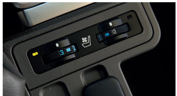
SEAT A/C FOR DRIVER AND FRONT PASSENGER