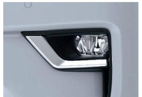
LED FOG LIGHTS