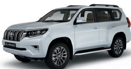
WHITE PEARL CRYSTAL SHINE