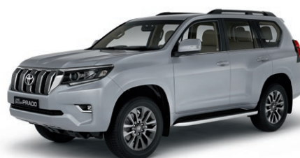
SILVER METALLIC 2